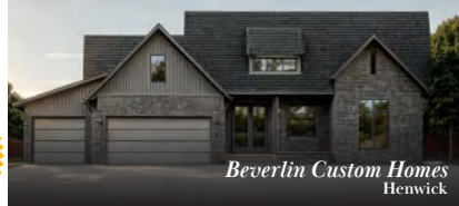
Beverlin Custom Homes Henwick

40 4442 Grey Meadows $601,000 - $650,000