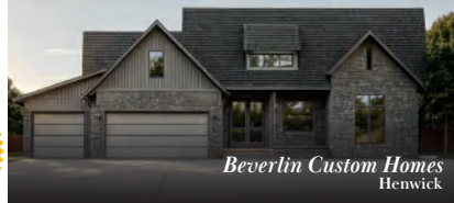
Beverlin Custom Homes Henwick

40 4442 Grey Meadows $601,000 - $650,000