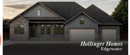
Hollinger Homes Edgewater

63 5807 W. Driftwood $601,000 - $650,000