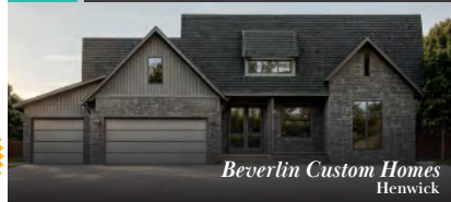
Beverlin Custom Homes Henwick

40 4442 Grey Meadows $601,000 - $650,000