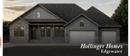
Hollinger Homes Edgewater

63 5807 W. Driftwood $601,000 - $650,000