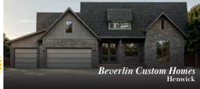
Beverlin Custom Homes Henwick

40 4442 Grey Meadows $601,000 - $650,000